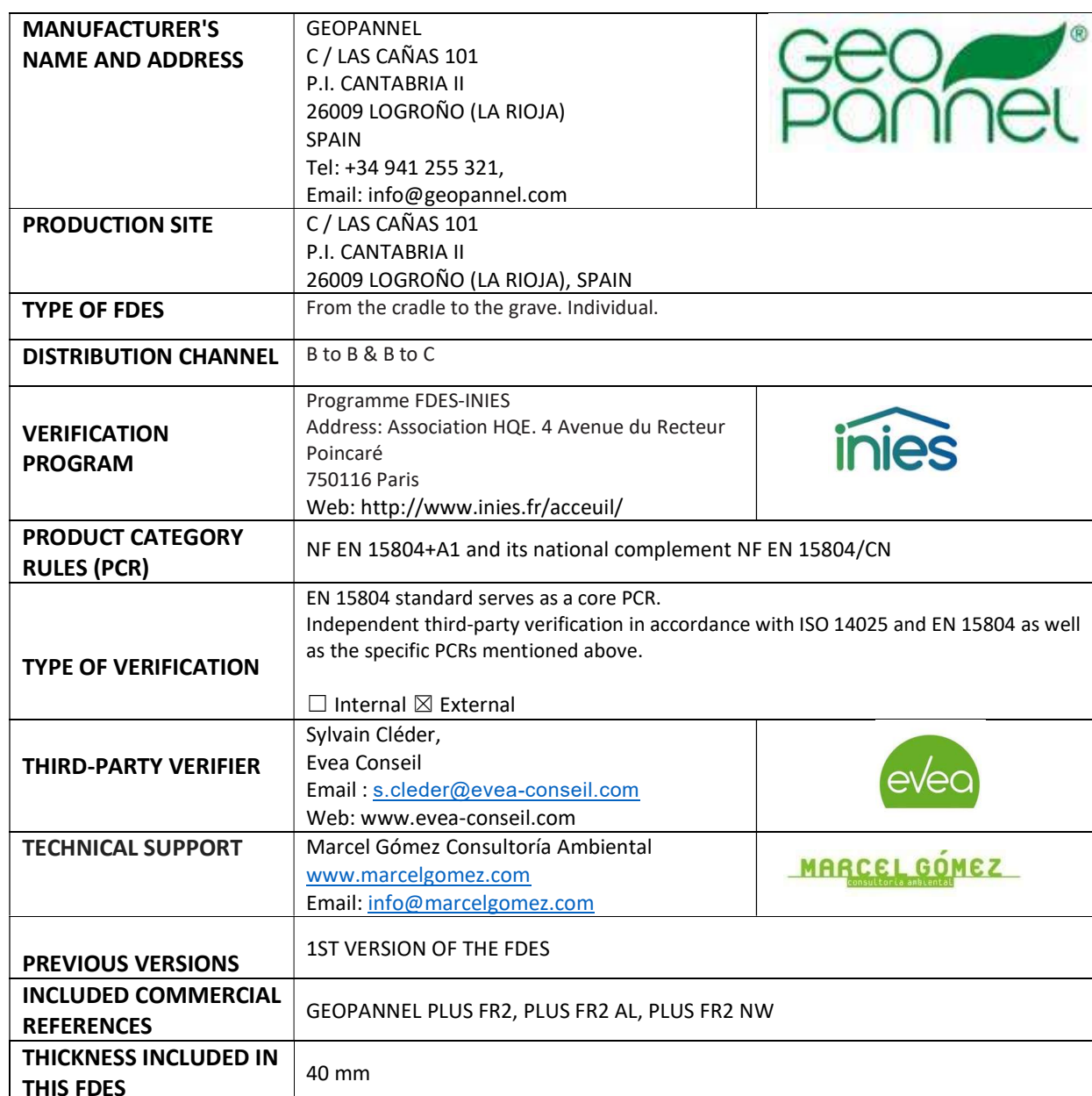
Table 1 General information